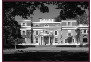
Home of Franklin D. Roosevelt