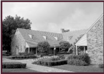
FDR Presidential Library