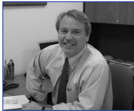
FDR Presidential Library