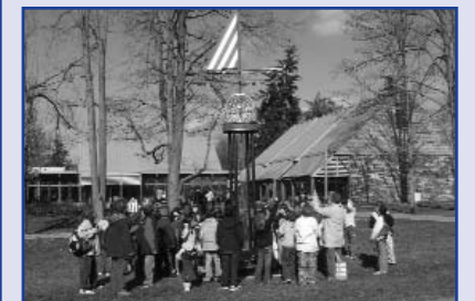
FDR Presidential Library

The Franklin and Eleanor Roosevelt Institute unveiled an exciting new work of art based on the Four Freedoms by the noted kinetic sculptor, Henry Loustau on November 3, 2006. The sculpture is located on the grounds of the Franklin D. Roosevelt Presidential Library and Museum and will ultimately travel to other locations. Commissioned by the Institute as a way to bring the meaning of the Four Freedoms to young people, the work captures the essence of the Four Freedoms and the meaning of American patriotism through the sculptor's use of such familiar symbols as gold stars, bold stripes, and the incorporation of the colors red, white and blue.