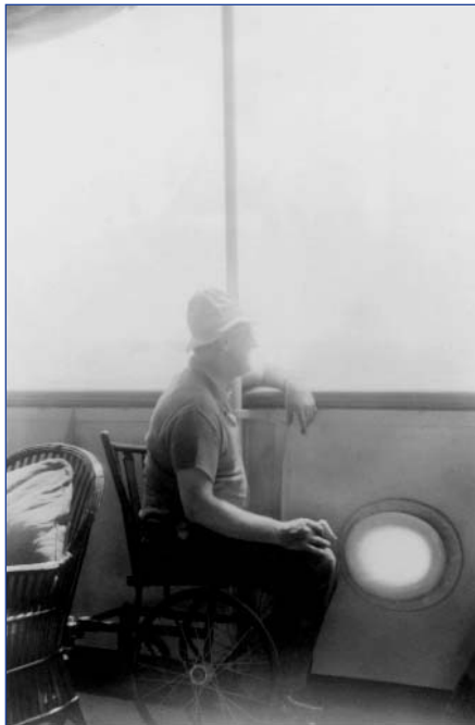
President Roosevelt in his wheelchair aboard the Astor yacht Nourmahal. April 1935.

In cooperation with the Southeastern New York Library Association, the Library launched its online book catalog, providing researchers access to more than 50,000 volumes. At the heart of the book collection is President Roosevelt's personal library of approximately 18,000 volumes. The archives also began this year to segregate from the general book collection the personal library of the President, which has been inter-shelved with the general collection since the Library's beginning.