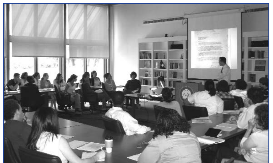
FDR Presidential Library Students attend a Junior Historians' Forum presented by the Gilder Lehrman Institute and the Roosevelt Library at the Henry A. Wallace Center, in Hyde Park. June 2006.

Recognizing the value of our collection to teachers in need of primary source documents, the Library's education department developed a series of half-day, full-day, and two-day Teaching with Primary Source Documents workshops. Last year nearly one thousand teachers from across the country attended.